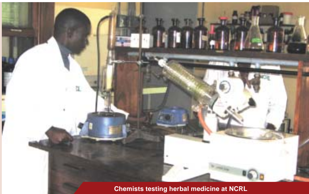
Chemists testing herbal medicine at NCRL