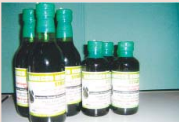
Packaged natural medicinal products ready for retail sale